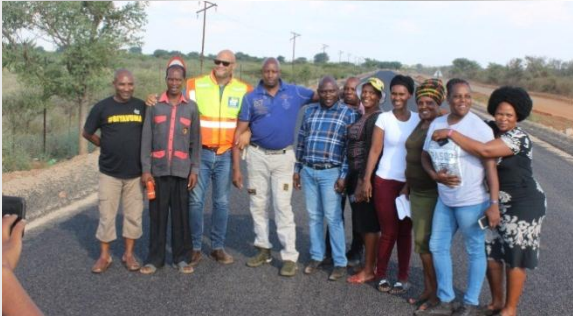
LLM Councillors on an oversight visit at the Sefihlogo to Letlora road (D3102-D3114)

The villages that will benefit from the upgraded road (D3102 and D3114) are Sefihlogo, Morwe, Botshabelo, Moong, Botsalanong, Kopanong, Kgobagodimo, and Letlora while the upgrading of road D3109 will benefit residents from Kiti, Motsweding, Dipompong and Mukuruanyane.