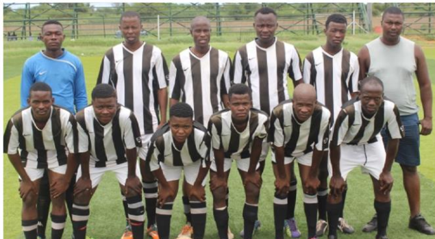
Taking home R50 000 in First place Callies FC from Ga-Seleka.