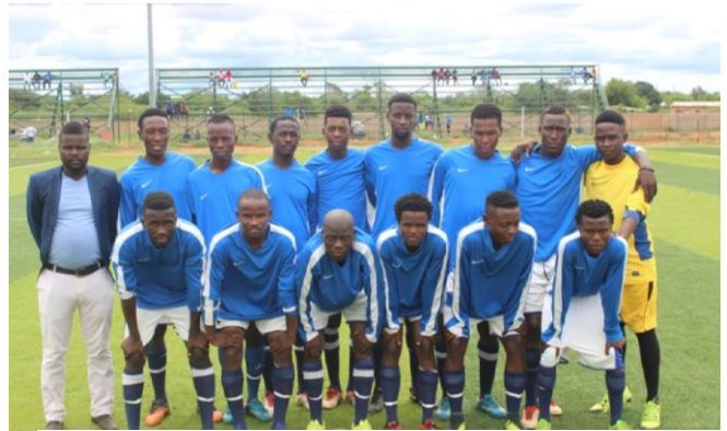
Peace Brothers from Ga-Mocheko were the runner up of the tournament taking home R30 000.