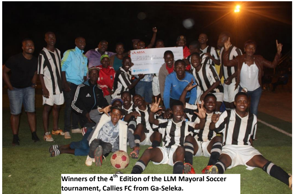
Winners of the 4 th Edition of the LLM Mayoral Soccer tournament, Callies FC from Ga-Seleka.

At least 32 teams participated in the LLM Mayoral Charity soccer tournament held at Thabo Mbeki Stadium last week. The week long tournament was won by Callies FC from Ga-Seleka village beating Peace Brothers from Ga-Mocheko 5-3 via penalties.