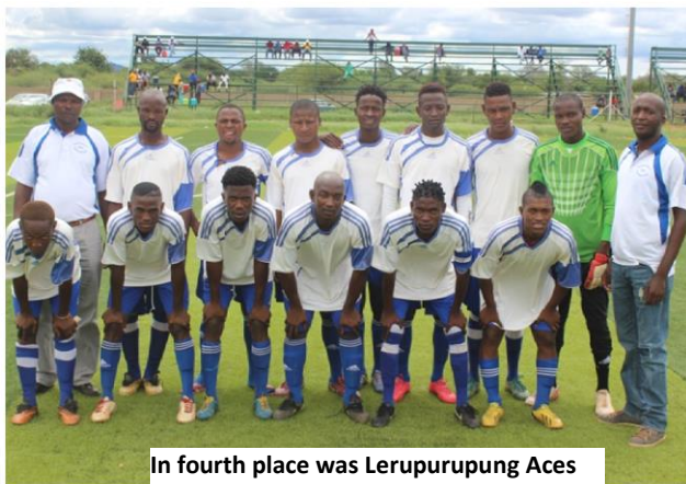
In fourth place was Lerupurupung Aces