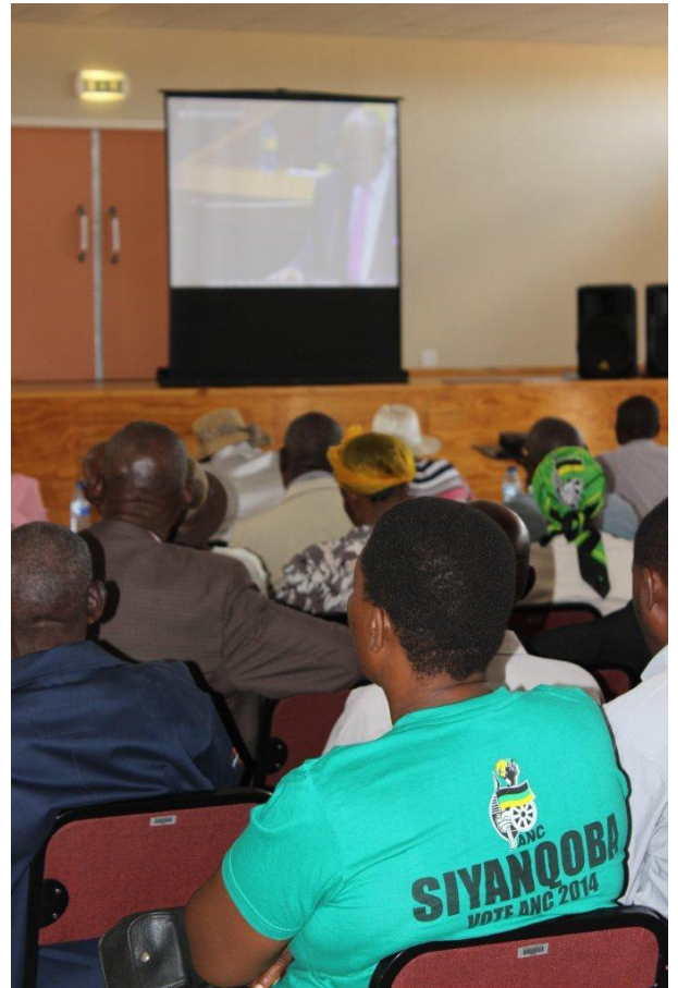
Community members listen to the State of the Nation address during a live screening at the Mokuruanyane Thusong Centre on 24 February.

“The implementation of the Back-to-Basics Programme as launched by the president must also be implemented without delay.”