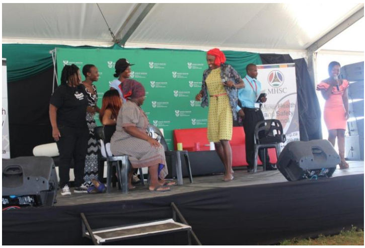
Edutainment: A local drama group entertains the crowd