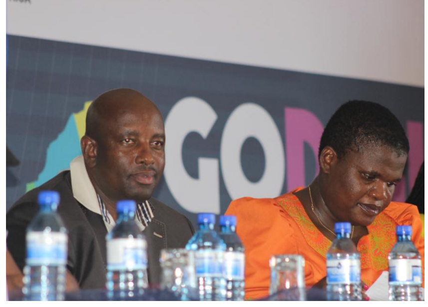
The Mayor of Lephalale, Cllr Moloko Jack Maeko and the Minister of Communication, Faith Muthambi at the opening of the National Imbizo Focus week at Ga-Seleka

Lephalale Municipality had the honour of hosting the opening of the National Imbizo Focus week. The traditional house and community of Ga-Seleka received Communication Minister, Faith Muthambi with open arms and welcomed her to one of the fastest growing municipalities in South Africa.