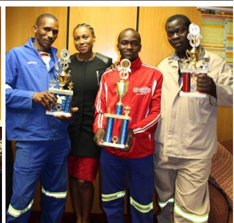
A vibrant city and the energy hub