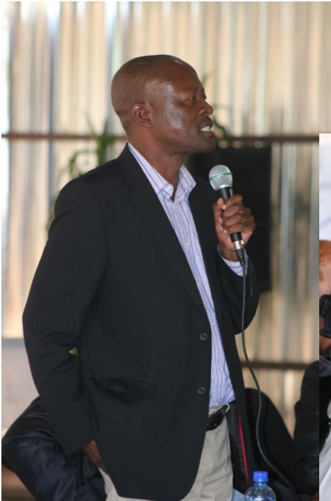
Dan Sebabi, Provincial Legislature chairperson of chairpersons/committees